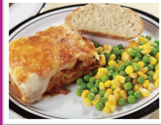
Beef Lasagne served with Garlic & Herb Bread and Seasonal Vegetables