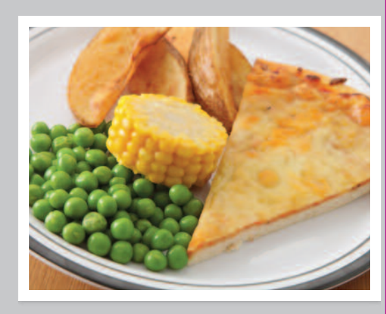
Cheese & Tomato Pizza, served with Potato Wedges & Seasonal Vegetables