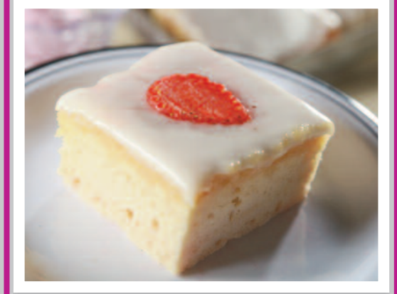
Strawberry Ice Cream Cake