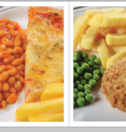
Cheese & Tomato Pizza or Salmon & Sweet Potato Fishcake (MSC) served with Chips & Peas or Baked Beans