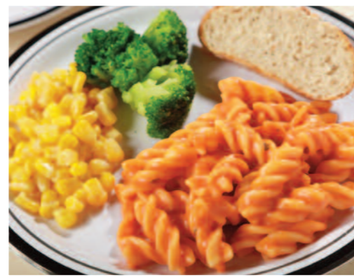
Tomato & Mascarpone Cheese Pasta served with Garlic & Herb Bread and Seasonal Vegetables