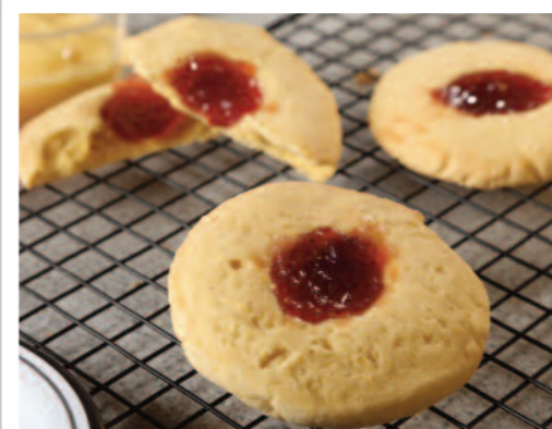
Jam & Custard Biscuit