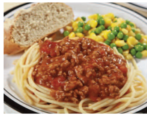
Spaghetti Bolognese served with Garlic & Herb Bread and Seasonal Vegetables