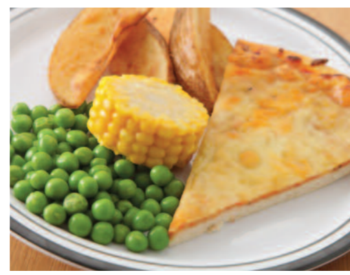
Cheese & Tomato Pizza, served with Potato Wedges & Seasonal Vegetables