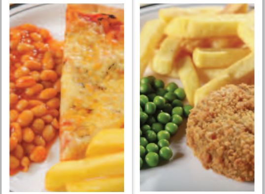
Cheese & Tomato Pizza or Salmon & Sweet Potato Fishcake (MSC) served with Chips & Peas or Baked Beans