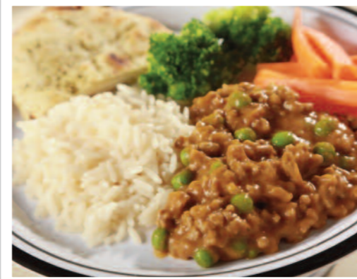
Beef Keema served with Rice, Naan Bread & Seasonal Vegetables