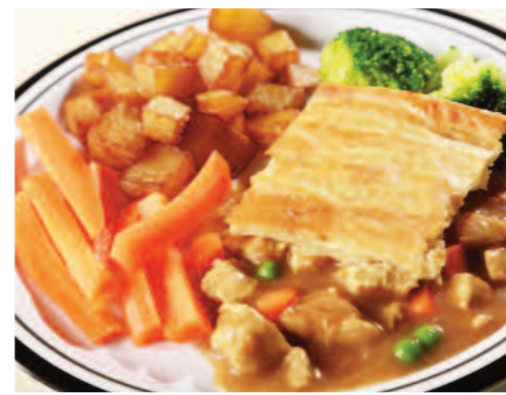
Homemade Chicken Pie served with Diced Crispy Potatoes & Seasonal Vegetables