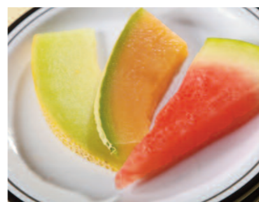
Trio of Melon