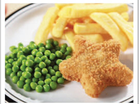
Fish Star (MSC) served with Chips & Peas or Baked Beans