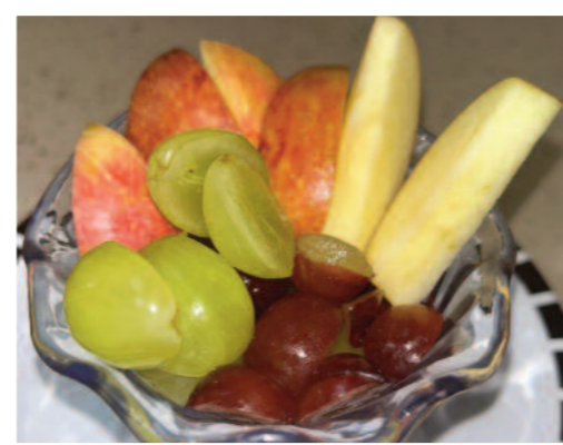
Apple & Grape Pot