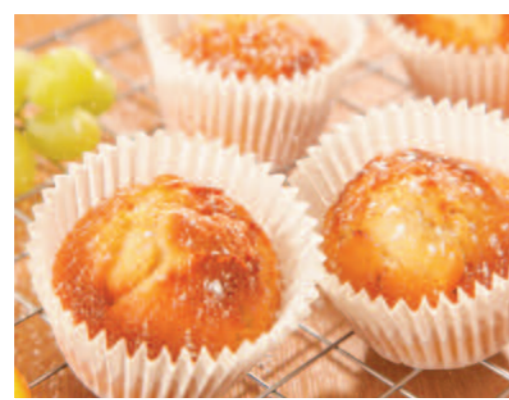
Apple & Cinnamon Muffin