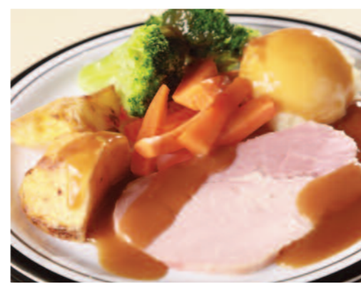
Honey Roast Gammon served with Roast/Mashed Potatoes, Seasonal Vegetables & Gravy