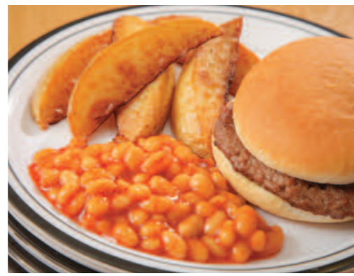
Beef Burger served in a Bun with Potato Wedges & Seasonal Vegetables or Baked Beans