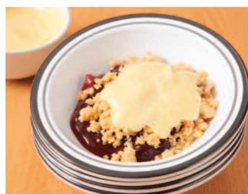
Fruit Crumble & Custard