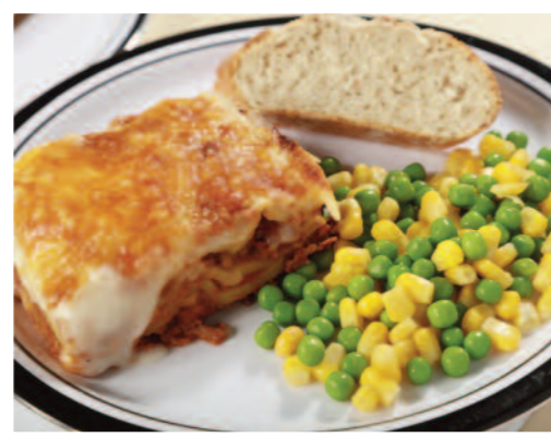
Beef Lasagne served with Garlic & Herb Bread and Seasonal Vegetables