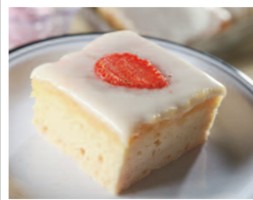
Strawberry Ice Cream Cake