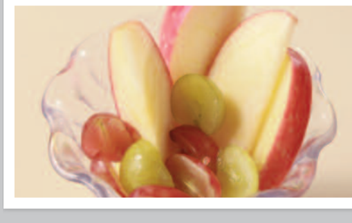
Apple & Grape Pot