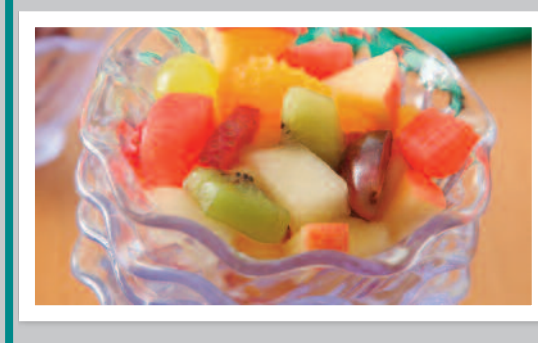
Fresh Fruit Salad