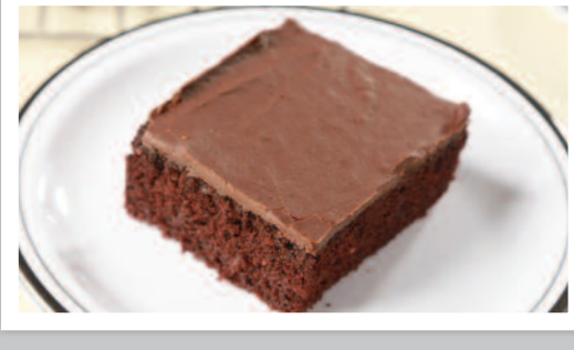
Iced Wacky Chocolate Cake