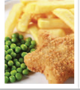
Salmon/Cod Fish Star (MSC) served with Chips & Peas or Baked Beans