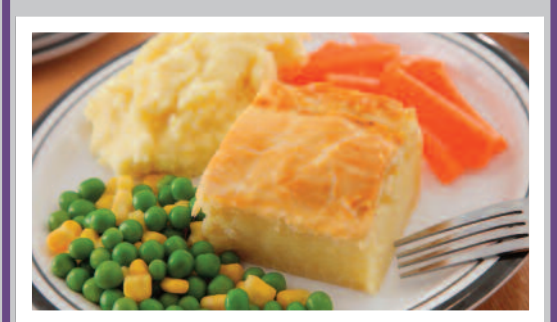
Cheese & Potato Pie & served with Roast & Mashed Potatoes & Seasonal Vegetables